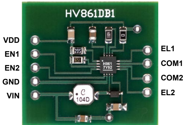
Actual Dimensions: 26mm x 24mm